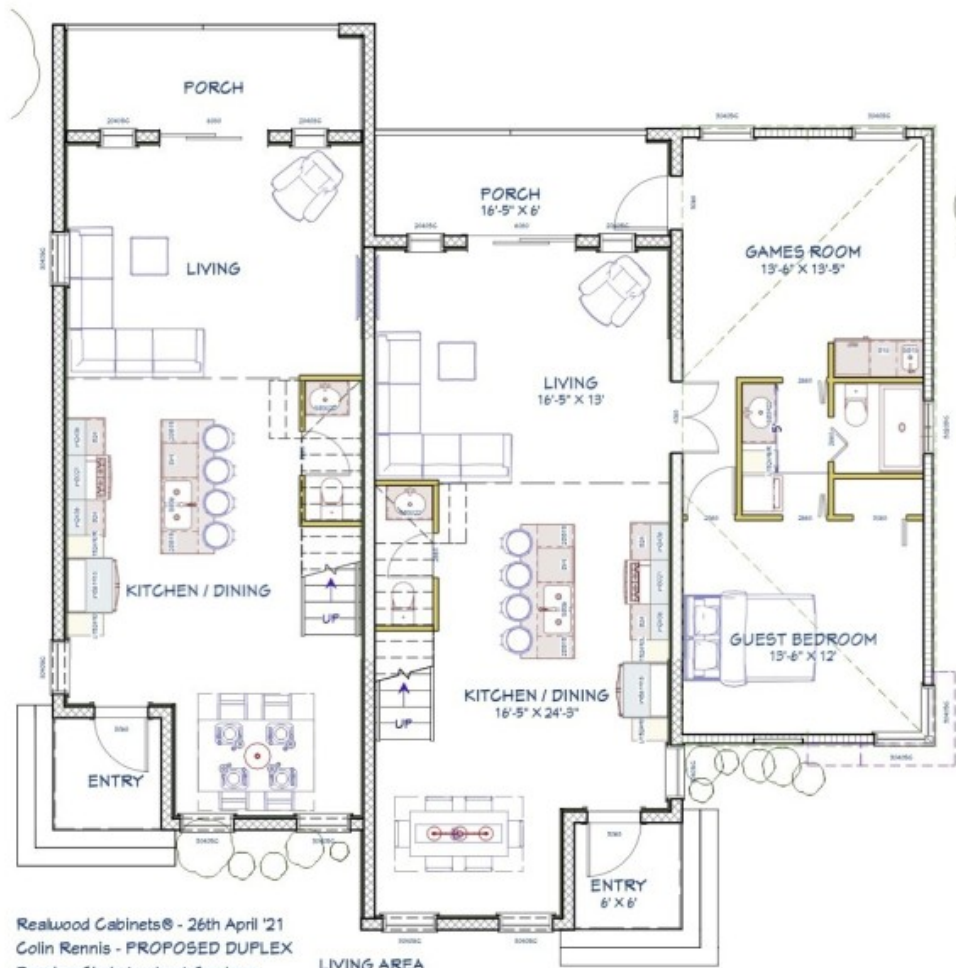
Realwood Cabinets® - 26th April '21 Colin Rennis - PROPOSED DUPLEX Passion Circle Lookout Gardens, Bodden Town, Grand Cayman